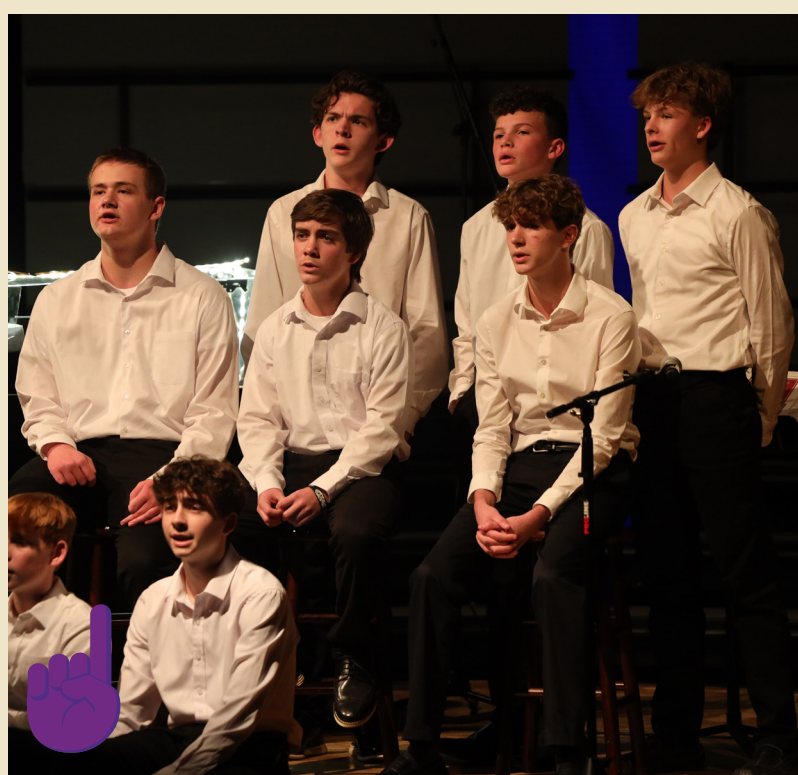
Tap to see photos from the Choir Christmas Concert.