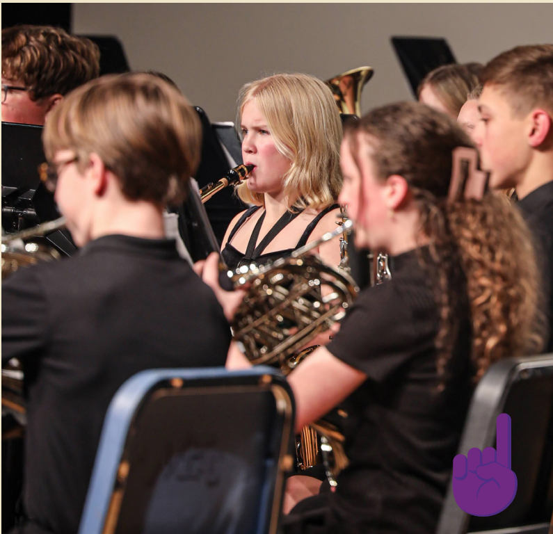
Tap to see photos from marching and concert bands.