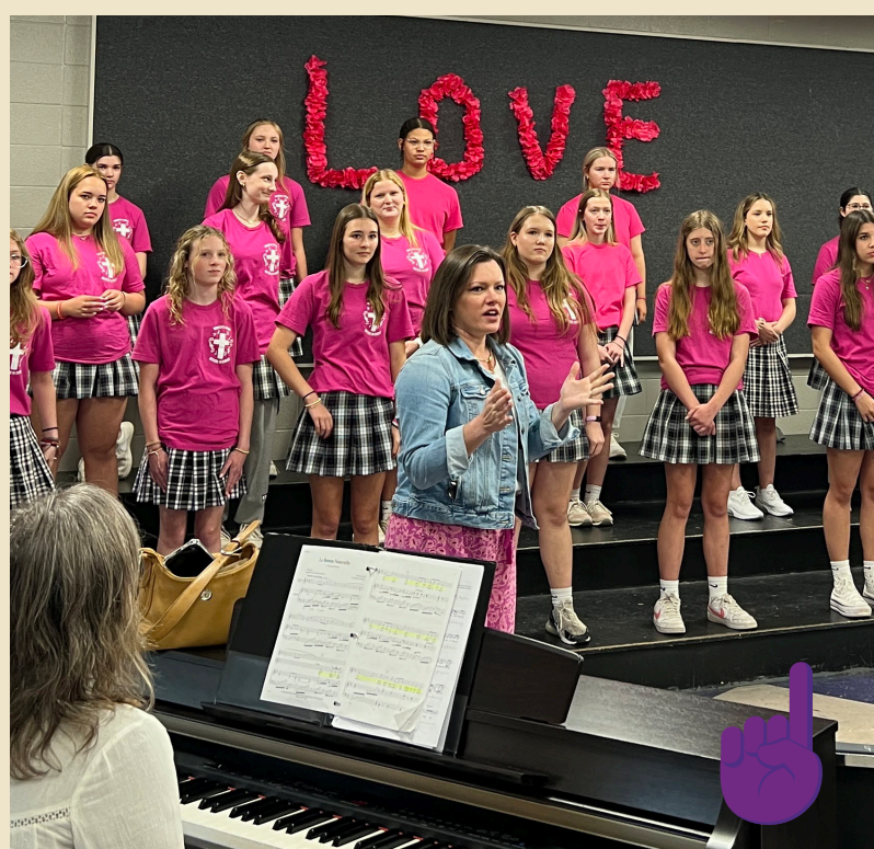
Tap to see photos from the Women's Choir Luncheon.