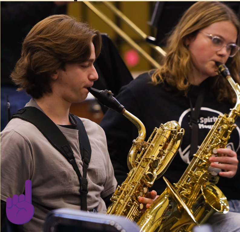
Tap to see photos from Jazz Band.